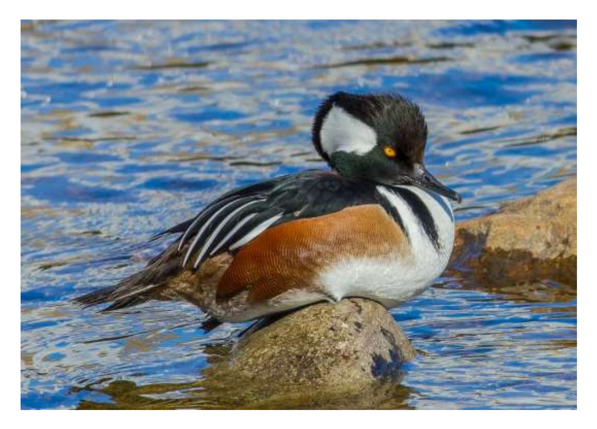
CBC data has shown hooded mergansers to be increasing in number. We've found them on 7 of 12 Belleville CBCs usually on open sections of the Moira River like this fellow loafing in downtown Belleville.

The Quinte Field Naturalists Association, an incorporated affiliate of Ontario Nature, is a non-profit organization sponsoring nature education, conservation and research. It was founded in 1949 and incorporated in 1990, and encompasses the counties of Hastings and Prince Edward. The Quinte Field Naturalists Association is legally entitled to hold real estate and accept benefits. Quinte Field Naturalists meet on the fourth Monday of every month from September to March (except December), 7:00, Sills Auditorium, Bridge Street United Church, 60 Bridge Street East, Belleville. In April we hold our annual dinner at an alternate time and location. New members and guests are always welcome. Bring a friend.