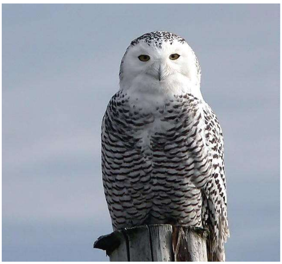
Paul O'Toole of Kingston found this magnificent snowy owl during the "snowy owl winter" of 2013-14. More information on page 2.