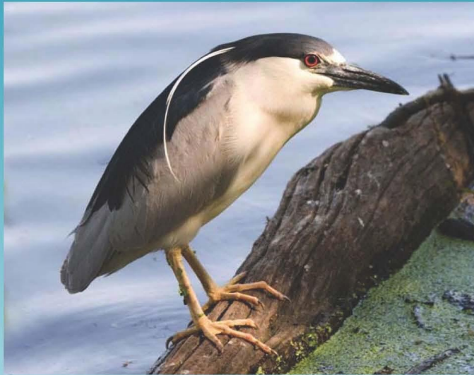
Black Crowned Night Heron ( Nycticorax nycticorax )

Monday, March 7, 2016 - 7:00 p.m. Quinte Conservation, 2061 Highway #2