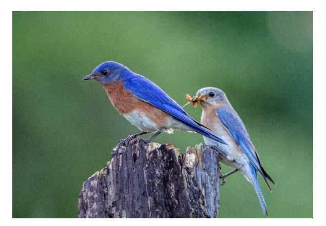
Eastern Blubird.