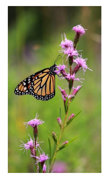
Monarchs are another species which loves tallgrass prairie.