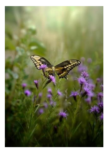
Tallgrass prairie is a haven for butterflies. This swallowtail was at Red Cloud School Road.

Now NCC is once again setting its sights on Salt Creek Valley. We have a conservation opportunity immediately west of Red Cloud School Road. NCC has an agreement to purchase the 39-hectare (96 acre) Teleki-Dukes property – our biggest project to date in the watershed. If not protected, this intact oak woodland and mixed forest habitat could be lost to development.