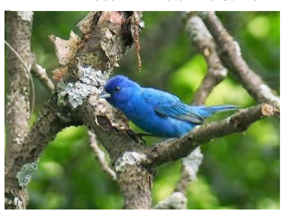
Indigo Bunting.