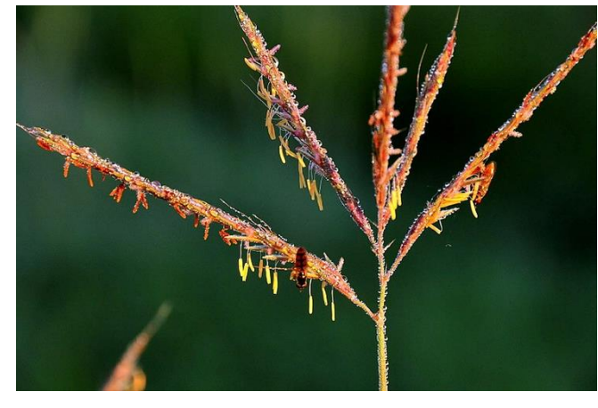
In bloom big bluestem is also known as turkeyfoot. Notice the small bee.

In 2015, while the newly restored tallgrass communities were beginning to flourish, another remnant site came up for sale just down the road. The landowners had enjoyed the site as a recreational property and were intrigued by the idea of selling it for conservation.