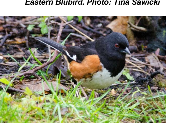
Eastern Towhee