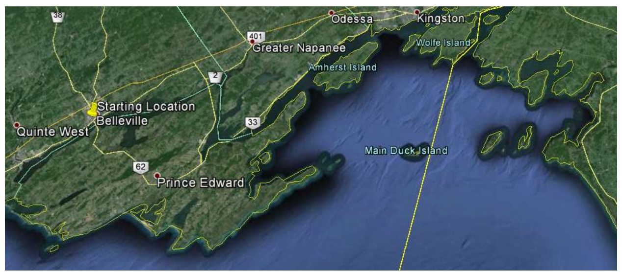
Map by Google Earth

It really is the issue that will not die. Should wind turbines be built in ecologically sensitive areas? Kingston Field Naturalists have calculated that over 1000 turbines are placed or planned in eastern Lake Ontario defined as Prince Edward County and the part of the lake contained by the chain of islands which includes Main Duck Island. Here's a brief look at three of those projects.