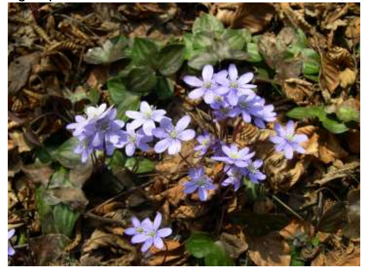
Cheer up. Hepaticas will soon be blooming.

There is another key difference in the three projects. It's one thing to launch a lawsuit against a faceless government landowner. Clearly even that has raised considerable rancour in Prince Edward County. It would be a different matter to try to stop a project which has a considerable financial benefit for a next door landowner.