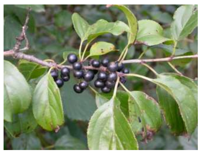
It's a problem as an invasive but at least common buckthorn does provide winter food for several bird species.

Watch for pine grosbeaks early in the season. Drought in the province has made many of the