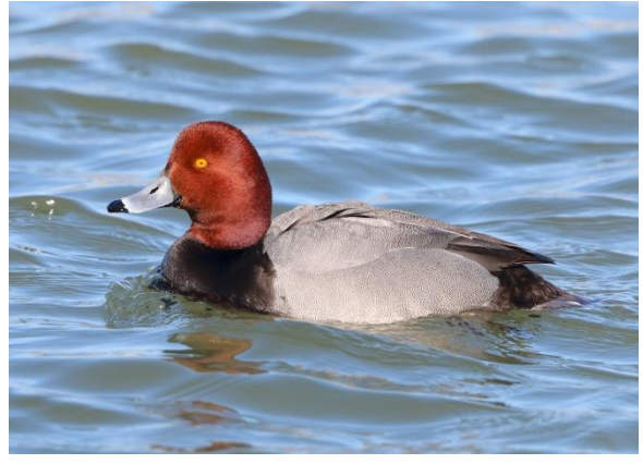
Redhead, One of the New Species Found on This Year's CBC

Counters found 7860 birds, more than 1000 above the average., and 58 species, the second highest number in the fourteen years of the count. There were two species (Redhead and American White Pelican) which were firsts for count day and a third new species (Snow Goose) found during count