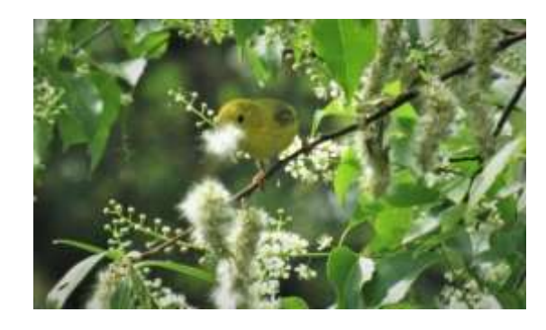
A yellow warbler spent a day collecting willow catkins.

The last week along Atkins Rd. has been sparrow city. Earlier this week I had 10 species of sparrow on my morning survey (and still waiting for the first tree and fox sparrows to arrive) Yesterday there were 2 very late grasshopper sparrows posing in the morning sun