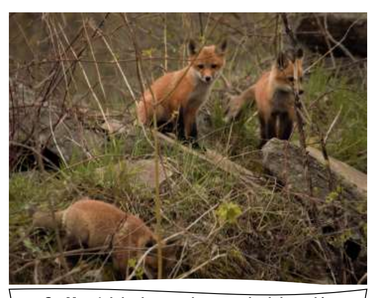
On May 4 John Lowry photographed these kits playing near St. Paul St. which runs just north of the water treatment plant. They are undoubtedly Michelle's foxes. Any area left unmanicured can support wildlife. It may not be beautiful by human standards but these foxes see it as home.

I have been "entertained" by the fox that travels the streets of old East Hill. Many days, of late, I have spotted a fox heading north on Foster Avenue early in the day, perhaps around 6. In 45 minutes or an hour later, same fox, heading south usually with a squirrel as a prize. One day, I saw it stop to pick up a recent road kill, so it had 2 prizes to take back to its offspring down near the water treatment plant. I have also seen one of the adults with one of the young, playing, in the "meadow" that is close to the turtle pond at the end of Foster. You would think, with all of the wildlife "below the tracks" that the foxes would hunt there, but maybe the animal residents of the "wharf" are smarter than those north of the tracks.