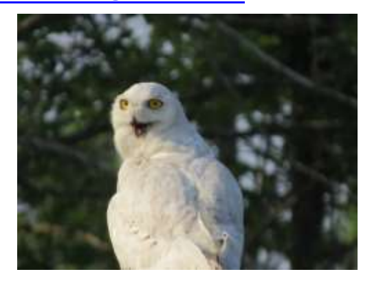
Everyone wants to find a snowy owl on their Belleville CBC. It's possible.

Participants in the count spend the day in small groups finding birds in an assigned area within 12 kilometres of Belleville city hall. If you don't want to spend the day outside you can be a feederwatcher if you live within the count circle. The Belleville count will be on December 27. For more information or to participate contact Tom Wheatley. bellevillecbc@outlook.com.