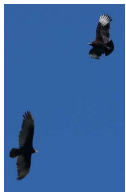
A black vulture (above) can be told from a turkey vulture (below) by the light and dark areas of the underwing. James Burk photographed these two birds at Point Pelee last March.

Nesting Season – Many of the species Gerry reported we also find near the bay. Chipping sparrow, rose-breasted grosbeak, eastern whip-poor-will and osprey are all seen nesting regularly in or near Belleville. The blue-headed vireo, yellow-throated vireo and red-shouldered hawk Gerry located are all more common in the Land Between because of the extensive woodlands they prefer in that region. This is likely a result of human-caused deforestation rather than a preference for the climate of the Land Between. In Prince Edward County they are virtually non-existent during nesting season.