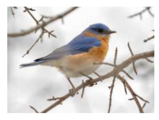
Some people are surprised to know eastern bluebirds may be found on a Belleville CBC.