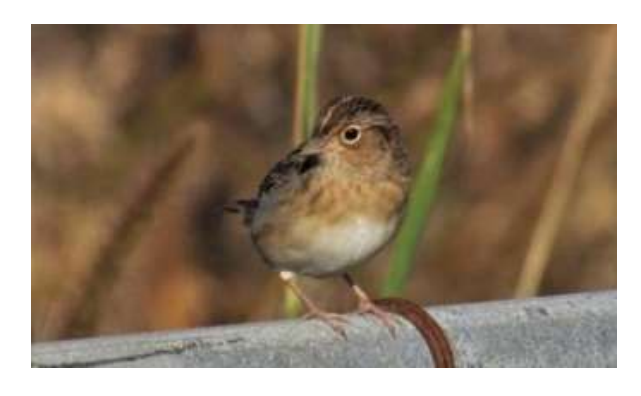
The Quinte Naturalist, Fall Roundup, 2021 - Page 13 -

The last week along Atkins Rd. has been sparrow city. Earlier this week I had 10 species of sparrow on my morning survey (and still waiting for the first tree and fox sparrows to arrive) Yesterday there were 2 very late grasshopper sparrows posing in the morning sun