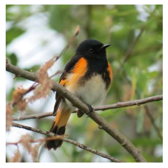
The American Redstart is another bright warbler found in the trees and bushes in the less-manicured sections of Belleville's waterfront.

conducted by ipsos on behalf of NCC in 2020 showed that 94% of people credit nature with helping them relieve the stress and anxiety of the pandemic and more than 85% of respondents said access to nature has been important to maintaining their mental health."