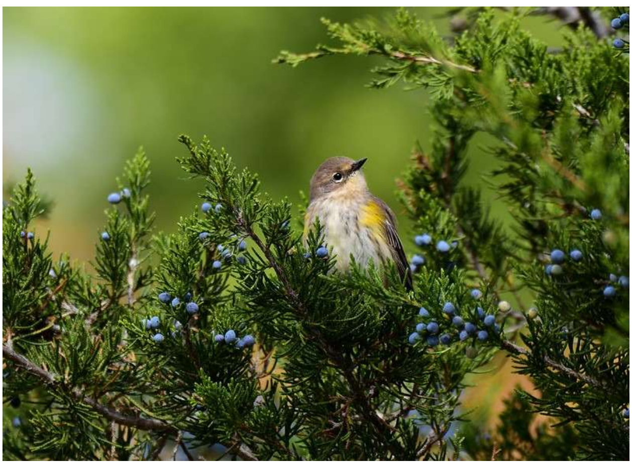
Paul O'Toole - Lemoine Pt - Bird Watching <a href="https://www.birdwatchingdaily.com/">https://www.birdwatchingdaily.com/</a>

FALL MIGRATION - On October 13 Gerry saw what he expects to be the last warbler he will see this year, a yellow-rumped warbler like the one in the picture above. This year some of the red cedars like this one have so many berries that they appear to be blue rather than green. Yellow-rumped warblers and robins love these berries when other food is scarce. Both are likely to occur on the Christmas Bird Count. (page 6)