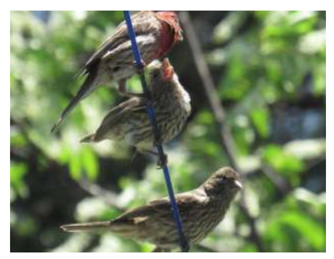
Lots of young house finches here now (they sample seeds, orange and hummingbird

His early June report told what birds in his yard were doing. These three species nested there