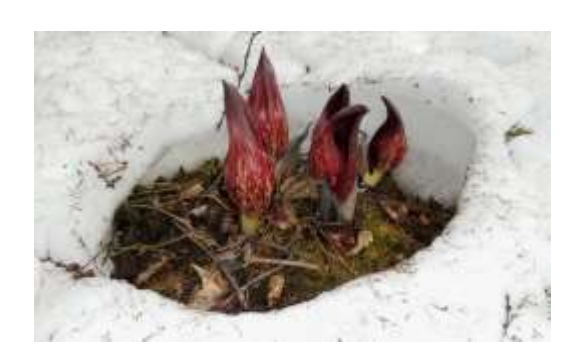
Because it can generate enough heat to melt the snow around it skunk cabbage is the first wildflower to appear in spring. Bears eat it when they emerge from hibernation. It has a diuretic effect which hastens the elimination of waste accumulated during the winter months.

It is the responsibility of each member to decide whether or not they attend an event/meeting, and to check their email for notification.