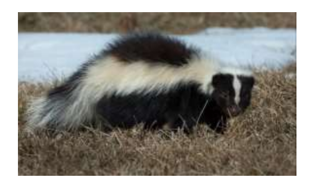
Striped skunks may occasionally forage on warmer days in winter. About this time of year they begin a serious search for mates. Male skunks are polygamous and defend a harem against other males. In the late nineteenth century furriers marketed the pelts as "Alaska sable."